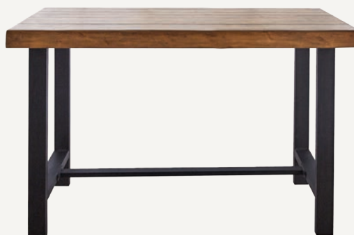
LD600PT COUNTER TABLE 30"W x 60"L x 38"H