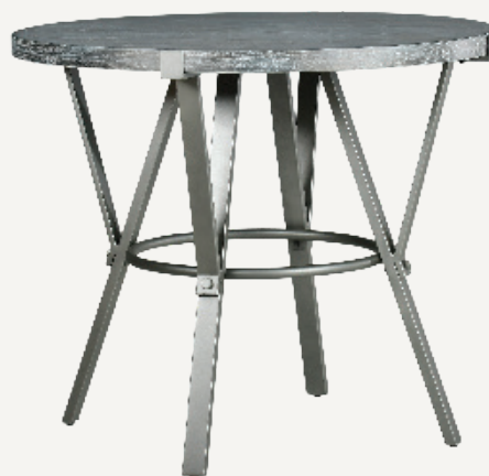
OR420PT COUNTER TABLE 42"W x 42"L x 36"H