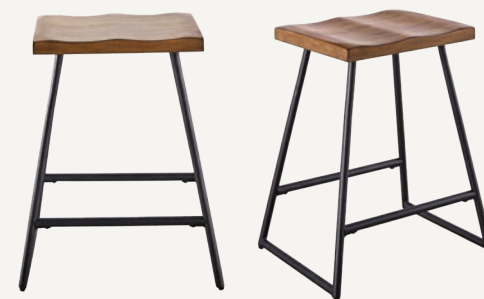
LD600CS COUNTER STOOL (2/ctn) 18"W x 14"D x 25"H