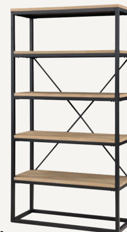
MM500KBC BOOKCASE 39.5"W x 15.5"L x 76"H