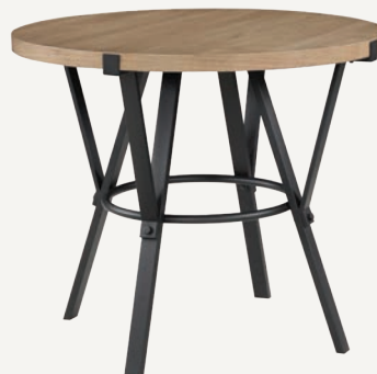
MM4242KPT COUNTER TABLE 42"W x 42"D x 36"H