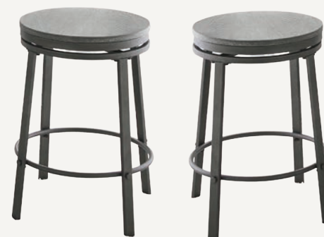
OR420CS SWIVEL COUNTER STOOL (2/ctn) 16"W x 16"D x 24"H