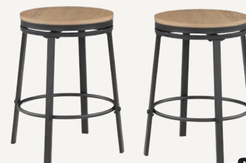
MM4242KCS SWIVEL COUNTER STOOL (2/ctn) 19"W x 23"D x 40"H