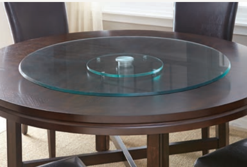
AV720LZ 40" LAZY SUSAN 40" Round, Triple Edge, 12mm Tempered Glass