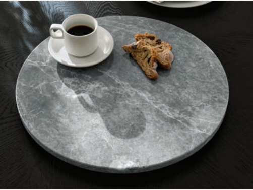
KZ180GLZ 18" ROUND GRAY MARBLE LAZY SUSAN 18"W × 18"D × 1.25"H