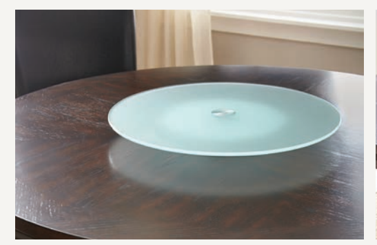
AV540LZ 22" LAZY SUSAN 22" Round, 8mm Frosted Glass