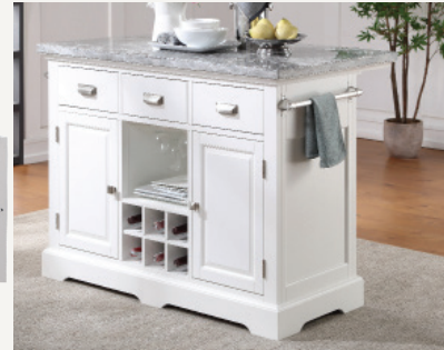
ZR380CKTB GRAY MARBLE KITCHEN COUNTER 48"W × 28"L × 36"H