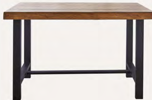
LD600PT COUNTER TABLE 30"W x 60"L x 38"H