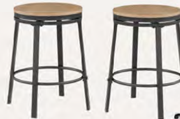
MM4242KCS SWIVEL COUNTER STOOL (2/ctn) 19"W x 23"D x 40"H