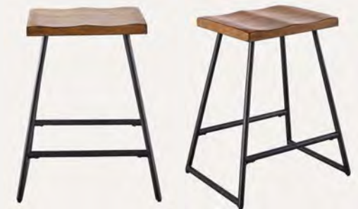
LD600CS COUNTER STOOL (2/ctn) 18"W x 14"D x 25"H