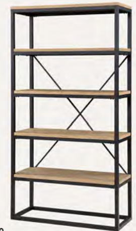
MM500KBC BOOKCASE 39.5"W x 15.5"L x 76"H