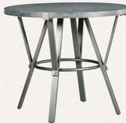
OR420PT COUNTER TABLE 42"W x 42"L x 36"H