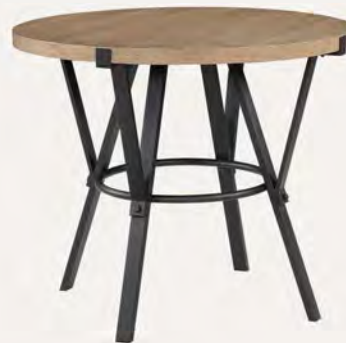
MM4242KPT COUNTER TABLE 42"W x 42"D x 36"H