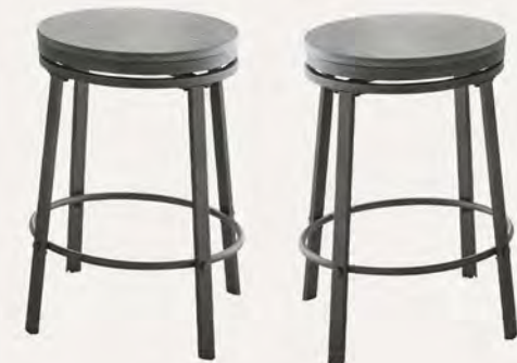
OR420CS SWIVEL COUNTER STOOL (2/ctn) 16"W x 16"D x 24"H