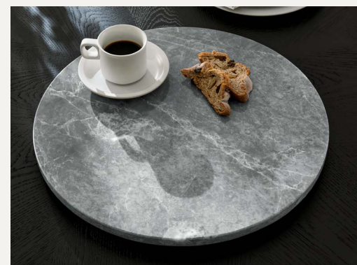
KZ180GLZ 18" ROUND GRAY MARBLE LAZY SUSAN 18"W x 18"D x 1.25"H