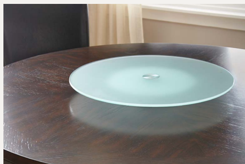
AV540LZ 22" LAZY SUSAN 22" Round, 8mm Frosted Glass