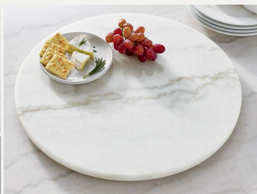
AK180WLZ 18" ROUND WHITE MARBLE LAZY SUSAN 18"W x 18"D x 1.25"H