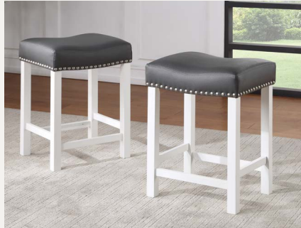
ZR380CS COUNTER STOOL, NATURAL (5/ctn) 18"W x 15"D x 24"H