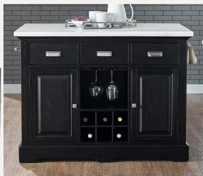
AS380CKTB WHITE MARBLE KITCHEN TABLE 19"W x 47"L x 33.5"H