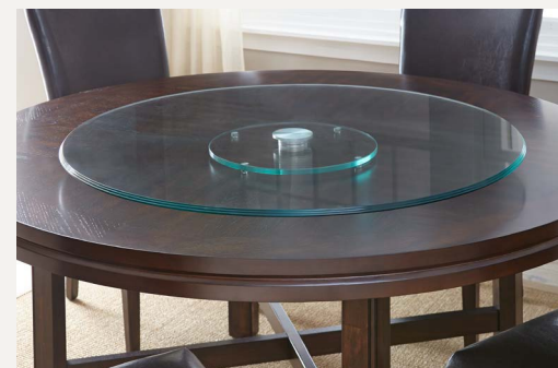
AV720LZ 40" LAZY SUSAN 40" Round, Triple Edge, 12mm Tempered Glass