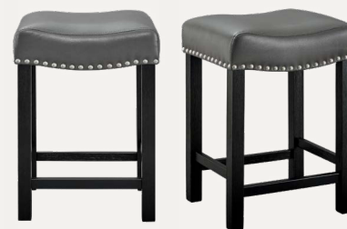
AS380CS COUNTER STOOL, GRAY (2/ctn) 18"W x 15"D x 24.5"H