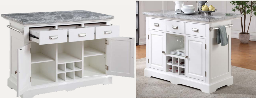
ZR380CKTB GRAY MARBLE KITCHEN COUNTER 48"W x 28"L x 36"H

Designed for storage, seating, and entertaining, the Zermatt Grey Marble Top Kitchen Island combines functionality, style, and durability, making it an essential addition to any kitchen.