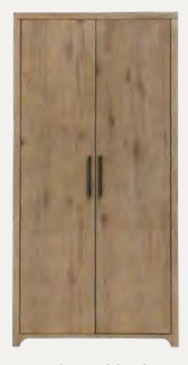
ORD500NC CURIO 38"W x 19"D x 78"H