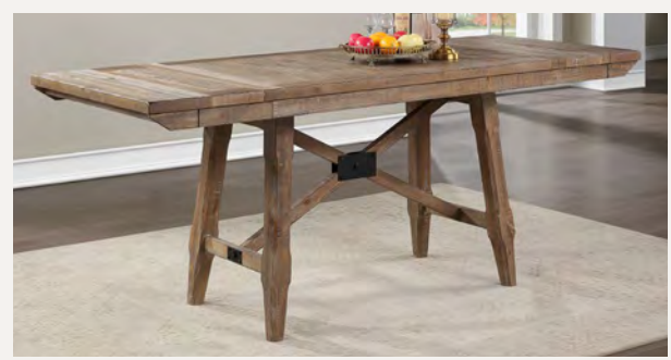
RV500PTTBC COUNTER TABLE w/2-12" LEAVES 72-96"L x 36"D x 36"H

Designed for modern farmhouse living, the Riverdale Counter Dining Collection offers timeless charm, spacious seating, and exceptional craftsmanship for any home.