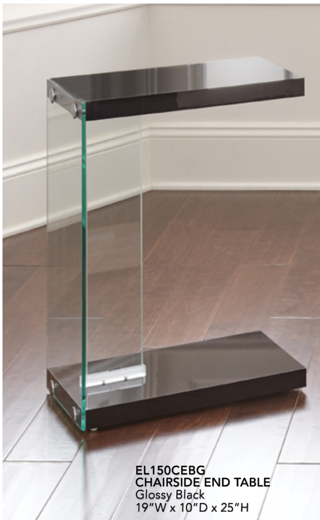
EL150CEBG CHAIRSIDE END TABLE Glossy Black 19"W x 10"D x 25"H