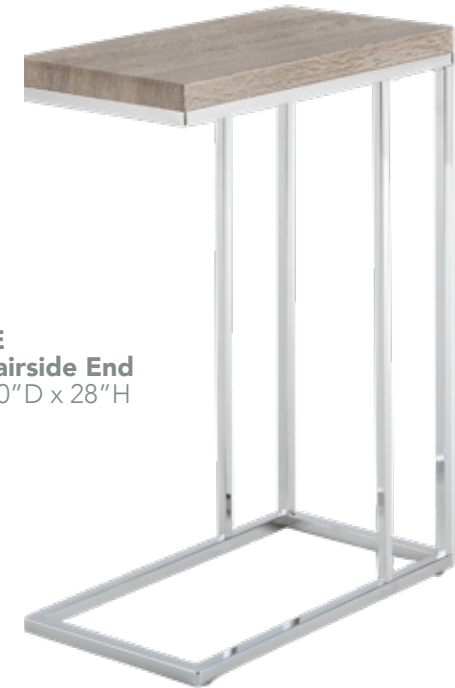
LU250CE Lucia Chairside End 18"W x 10"D x 28"H