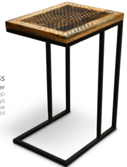
AR100SS Parris Sofa Server Mango Wood Top with Bone Inlays & Iron Base 14"W x 18"D x 26"H