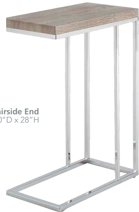
LU250CE Lucia Chairside End 18"W x 10"D x 28"H