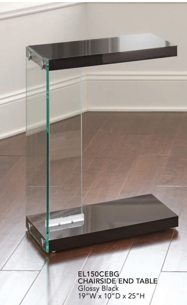
EL150CEBG CHAIRSIDE/END TABLE Glossy Black 19"W x 10"D x 25"H