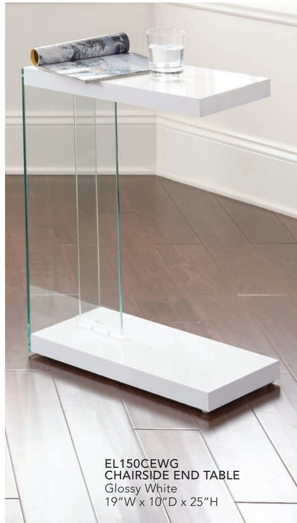
EL150CEWG CHAIRSIDE END TABLE Glossy White 19"W x 10"D x 25"H