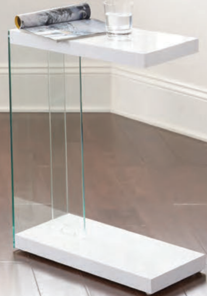
EL150CEWG CHAIRSIDE END TABLE Glossy White 19"W x 10"D x 25"H