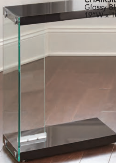
EL150CEBG CHAIRSIDE END TABLE Glossy Black 19"W x 10"D x 25"H