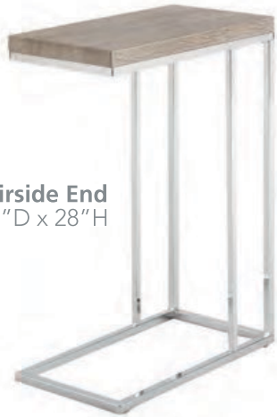
LU250CE Lucia Chairside End 18"W x 10"D x 28"H